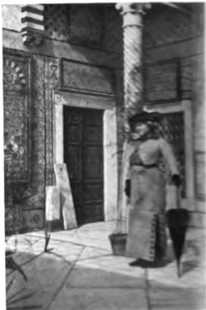
At the Bardo Palace.