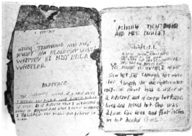
At the age of nine she had written a novel in ten chapters, called "Minnie Tighthand and Mrs. Dunley." It was printed by her childish hand on chance scraps of paper and found in paper torn from the kitchen wall.