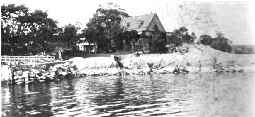
"The Bungalow" from the water.