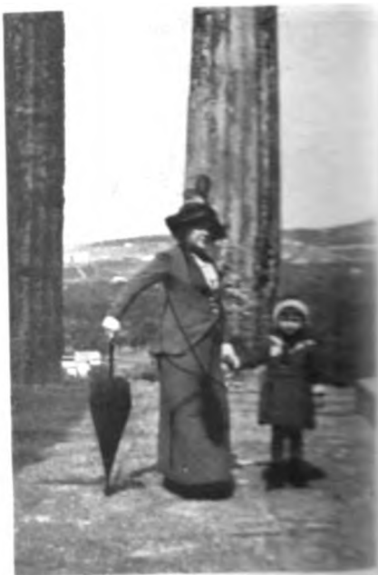
In Sicily. Ella Wheeler Wilcox with her godchild.