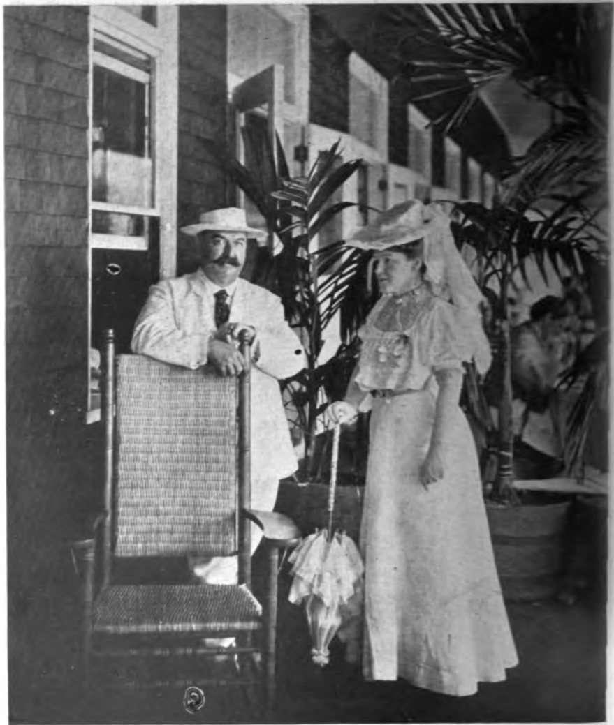
One of their happiest winters was spent in Jamaica, where they saw a great deal of Jack London and his wife, Charmian. This is a snapshot of them taken on the porch of the Hotel Tichfield, San Antonio, in 1909.