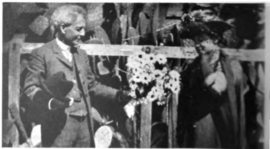
Luther Burbank and Ella Wheeler Wilcox.