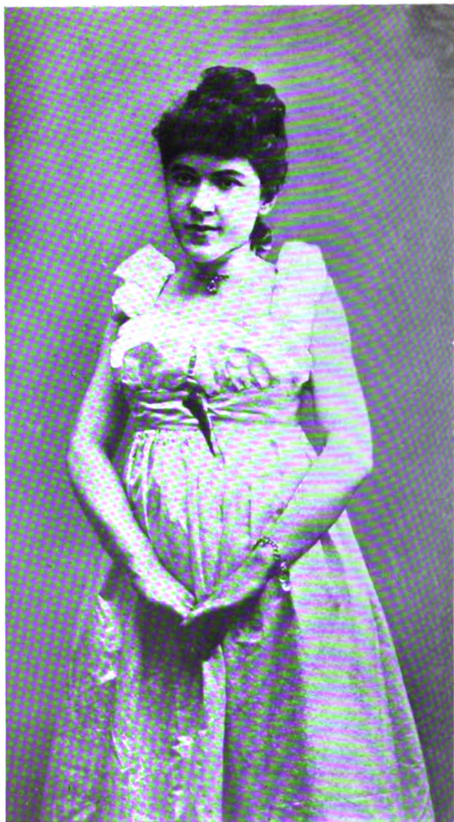
This is the gown she wore when she recited "The Birth of the Opal" at Mrs. Frank Leslie's salon. She tells us that it was her one and only attempt at recitation in public, and that she was convulsed with mirth when an imitation of it was given later.