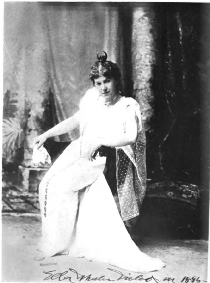
ELLA WHEELER WILCOX