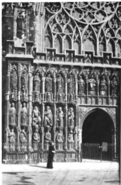
Before a great cathedral.