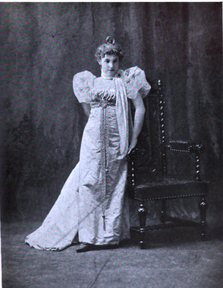
Ella Wheeler at the time of her marriage to Robert Wilcox, whom she met by chance while visiting in Milwaukee. They were both attracted from the first and the correspondence which followed served to heighten friendship into love. They were married in a year from the time they met.