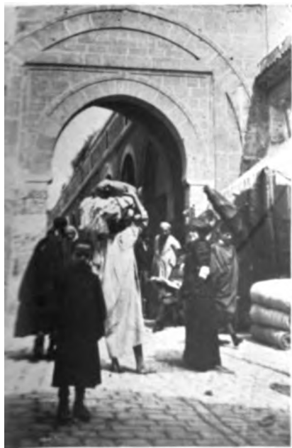
Tunis at the Gate of the Bey—April, 18.