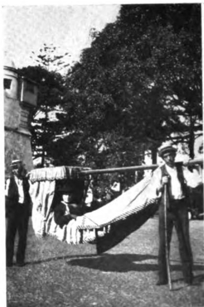
On the Island of Madeira.